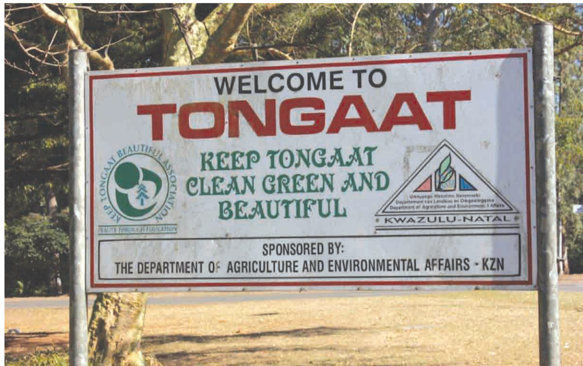
UThongathi elinye lamagama angu 200 ashintshiwe ngohlelo lokugququlwa nokulungiswa kwamagama ezindawo.

*Imininingwano iya tholakala emahhovisi ezoLimi kulenombolo 033-897 9000.