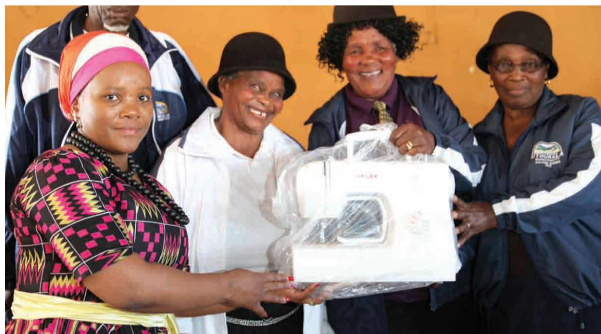
Isiphithiphithi semukele imishini evela kuNgqongqoshe.

Ngaphandle kweSiphithiphithi, maningi amaqembu nezinhlangano ezisizakele ngokufika kukangqongqoshe kulendawo njengoba izikhungu ezintathu zokufunda zabantwana zimukezwe