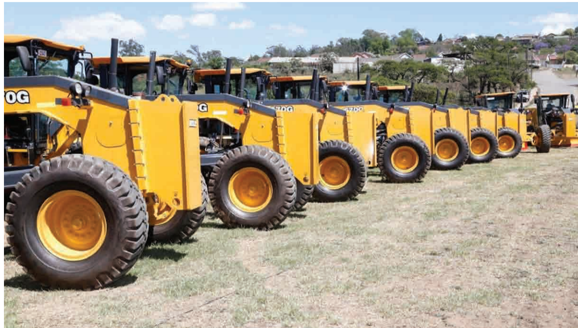
Ingxenywe yogeleja abangu-30 abasha uMnyango wezokuThutha obathenge enkampanini yakwa-Bell Equipment ngenhloso yokwenza ngcono imigwaqo yobhuqu esifundazweni.

“Ngiyajabula kakhulu ukuthi kulo Mnyango sibe yingxenywe yokufezekisa umbono kaHulumeni ukuba sinike izinkampani zasekhaya ithuba kuqala uma sithenga”.