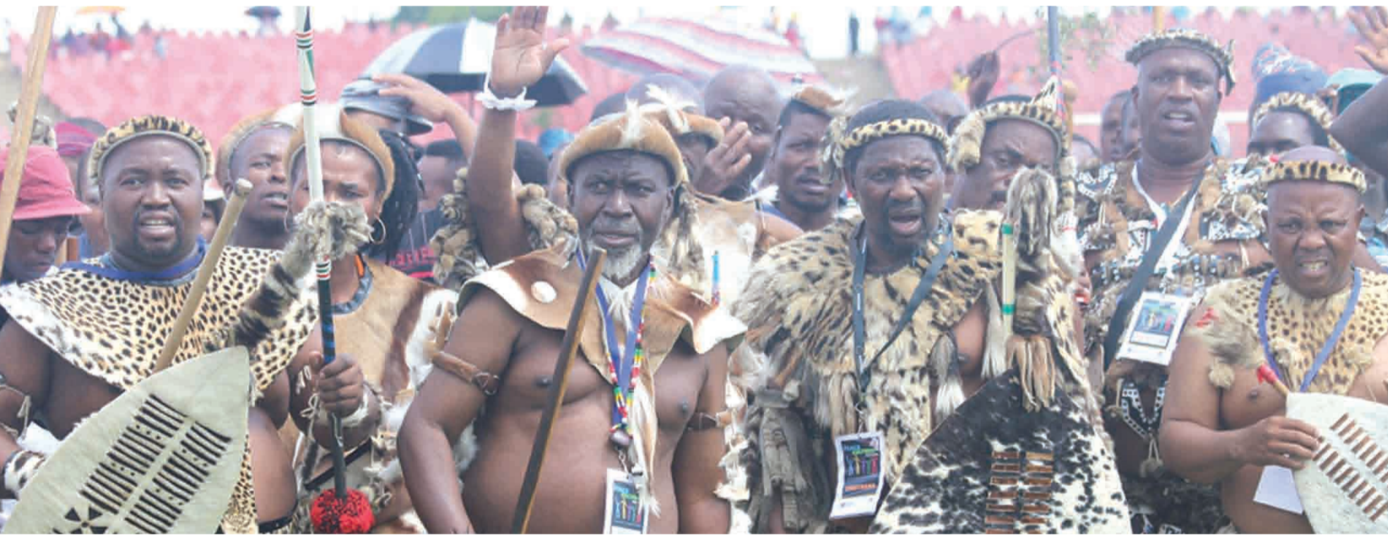
Amabutho abephume ngobuningi bawo ngempelasonto emcimbini wokugqugquzela ukuthula noxolo emahostela aseGoli