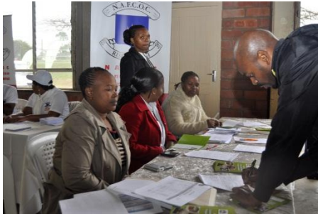
Guests during the registration at the Youth Summit