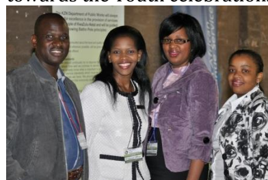
Representatives from KZN Public Works