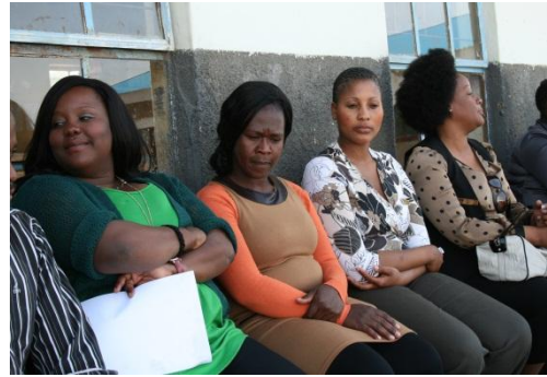
Educators from eSethu High School seated and cogitating deeply as presentation were conducted.