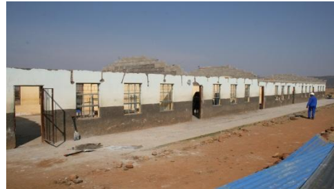
This is the state of disrepair of eSethu High School after being demolished by a heavy storm

This time it was a trip by the KZN Public Works' Umzinyathi District to eSethu High School, an educational facility situated far in the rural area of KwaMazabeko which is also next to KwaMahlaba, in Pomeroy. It has been observable and admired by virtue of positive results that Umzinyathi District Office carries the Public Works flag as we continue to inculcate for the KwaZulu-Natal youth on the relevance of the National Construction Week. This is a programme that seeks to continue raising awareness and equally arousing interest to pupils who are still at their prime time of making informed choices when about to complete their respective final Grade levels when ready to entering the tertiary sector.