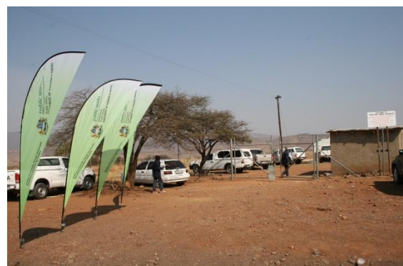
The entrance view of the eSethu High School.