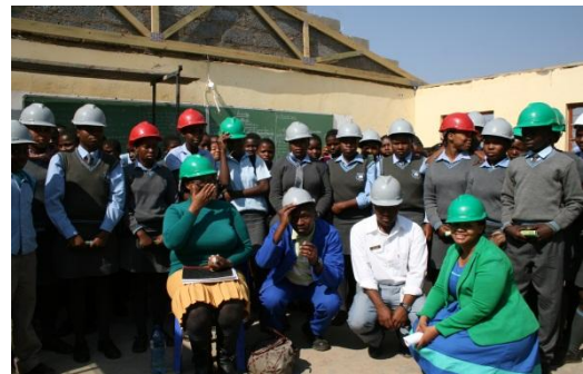
Seen here above and below are the learners during the site briefing session