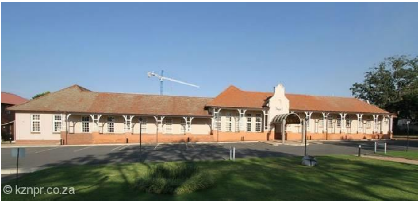
Page 26 of 67