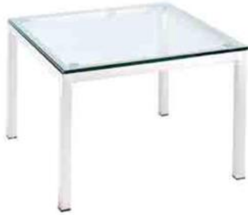
49 DIAGRAM S