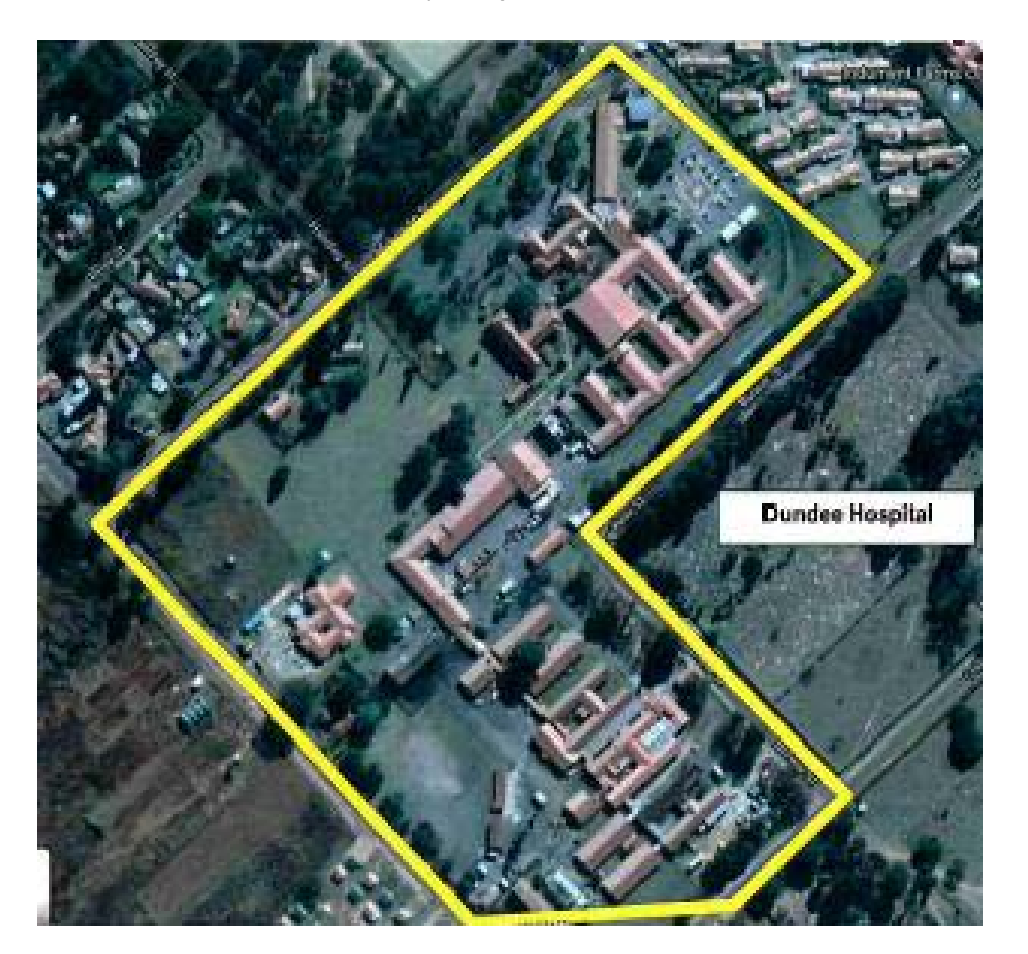
Photo1: Site location on aerial view

Location of the site as depicted by Google maps is as follows: