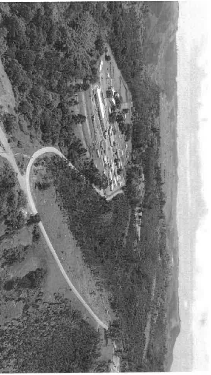
Figure 2: UMphumulo Hospital site drone imagery.