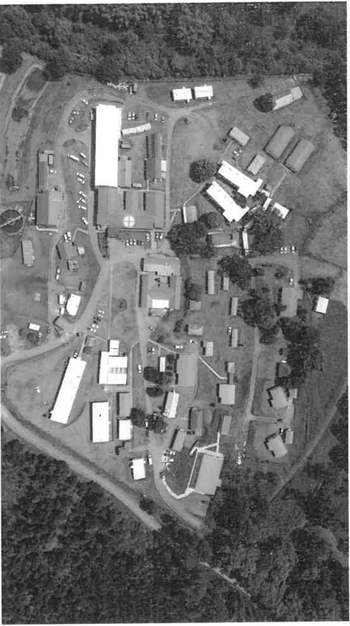
Figure 1: UMphumulo Hospital site drone imagery, (Author: 2022).