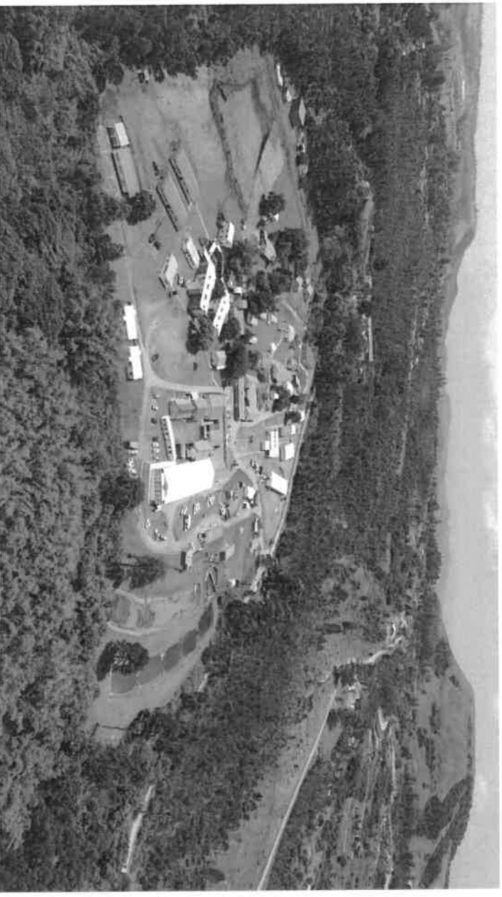
Figure 4: Umpumulo Hospital site drone imagery, (Author: 2022).

Detailed investigations were carried out on the existing buildings using the attached reference plan Annexure 1. The below images as a sample are categorized and referenced to the building usage.