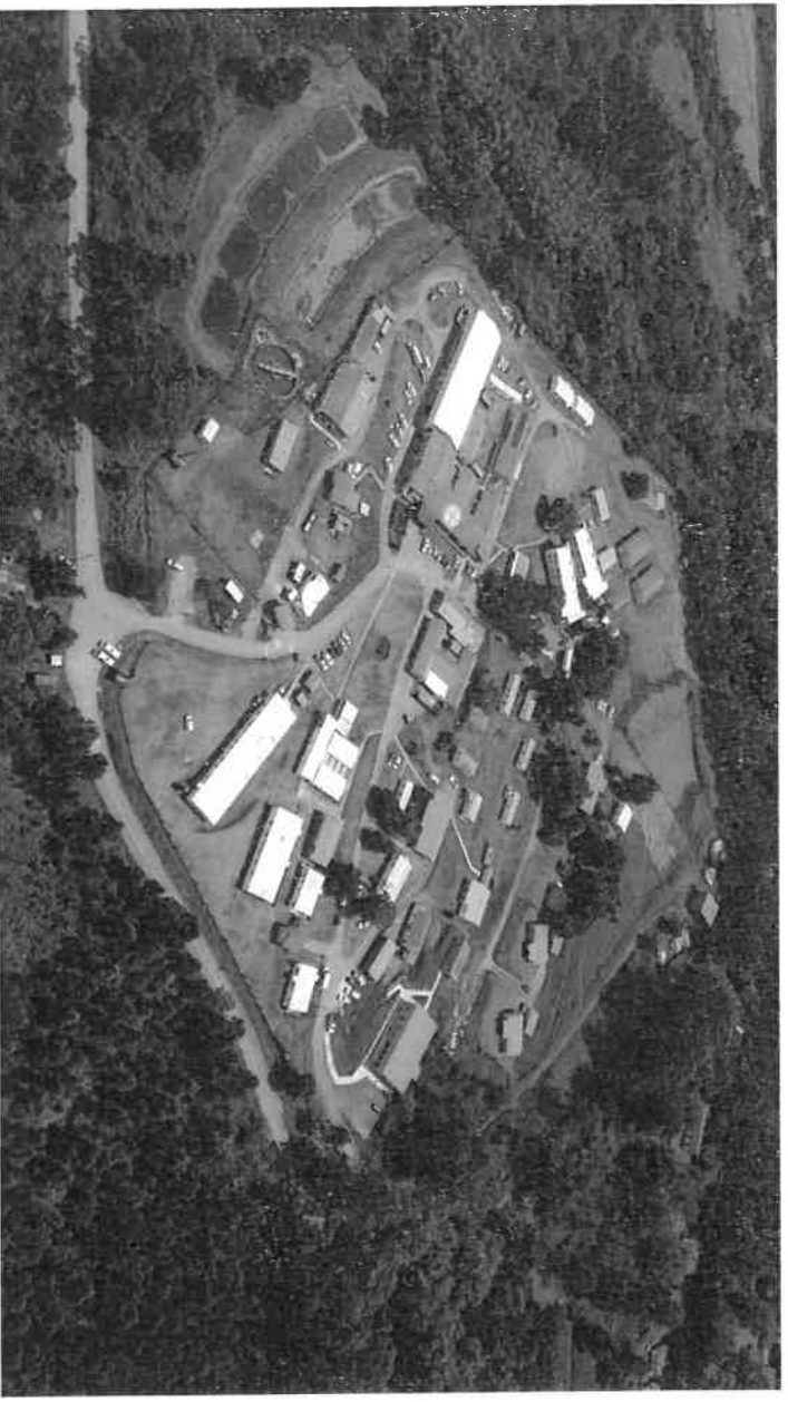
Figure 3: Umpumulo Hospital site drone imagery, (Author: 2022).