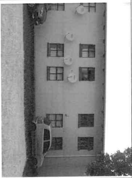
Cluster E: Other Services