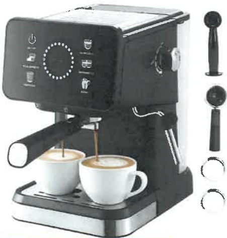
Espresso coffee machine