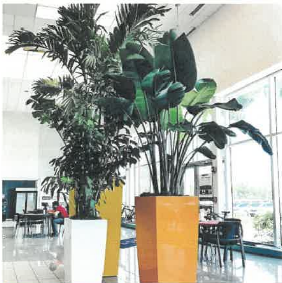
Indoor plant pots