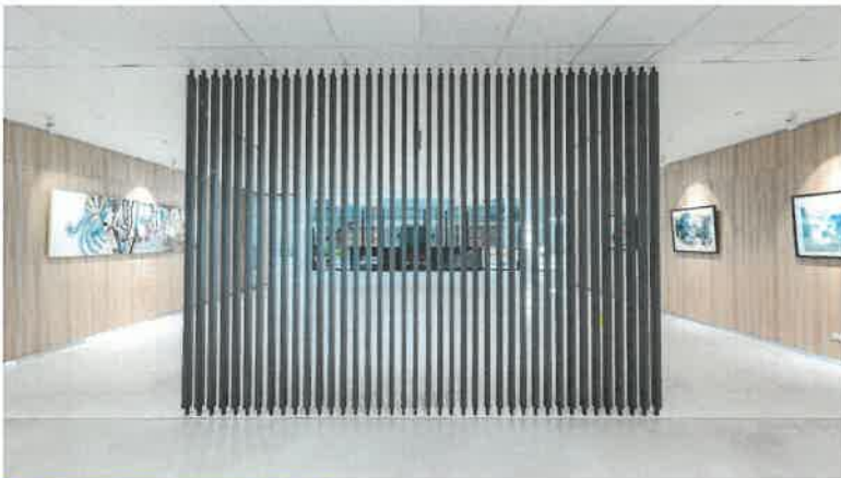
Timber slat screen wall