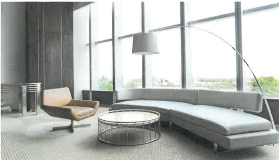
Coffee table with 2 chairs