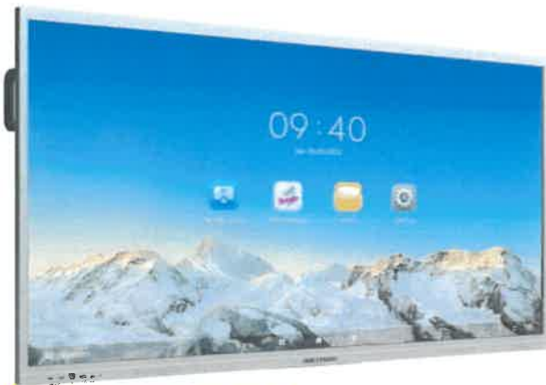
Touch screen smart TVs